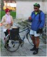
Refuelling on some home-made cake.