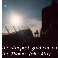
the steepest gradient on the Thames

Onwards along the estuary with great views in the sunshine. Some stretches of the track still had plenty of ice on them which required careful concentration, especially by me; 23mm tyres weren't