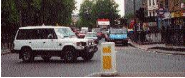
Do you live on a farm? - I don't think so. A very clean 4WD, complete with pointless bull-bar, crosses the very urban Cambridge Heath Road / Bethnal Green Road junction (during warmer months)

Remember that lovely cold snap a few weeks ago when Tower Hamlets was covered in a blanket of snow? Now, you'd think this would be an ideal time to get the four-wheel drive out the garage, wouldn't you? But oh no: we couldn't risk getting it mucky with slush, now could we. The roads were spookily yet wonderfully quiet, and not a 4WD to be seen. A couple of Micras aquaplaning at 3mph while their occupants giggled nervously, but no Land Rovers. I wonder why people buy them, then? Certainly not to help get their elderly relatives out and about. One would have to indulge in a spot of Granny-flinging to make that giant leap to the passenger seat. And the fuel consumption! No wonder they complain about the cost of petrol, with gaz-guzzlers like that. The mind boggles.