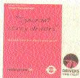
The safety campaign targets cyclists and CGVs

London Cycling Campaign HQ has described our antics as "brilliant stuff" and our efforts with the media as bringing "extraordinary success". This has been fun but hard work, so do lend a hand if media is your thing!